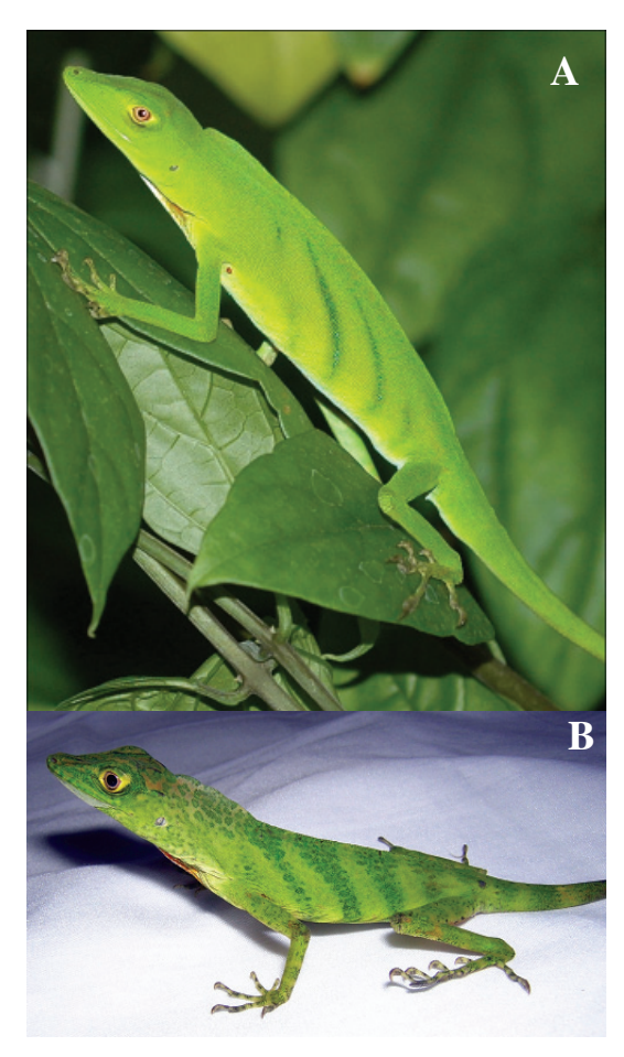
Figure 1 - (A) Adult male Anolis ibanezi sp. nov. (B) Adult male Anolis chocorum.