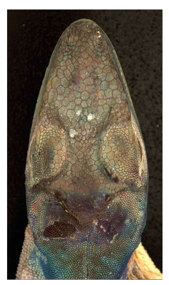
Figure 2 - Head scales of the adult male holotype of Anolis ibanezi sp. nov. (MSB 72574).