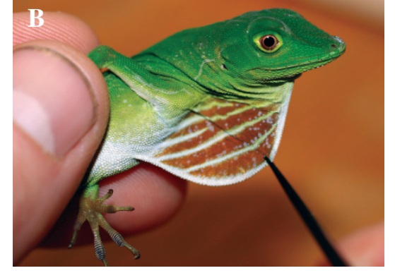
Figure 3 - Dewlaps of male (A) and female (B) \emph{Anolis ibanezi} sp. nov.