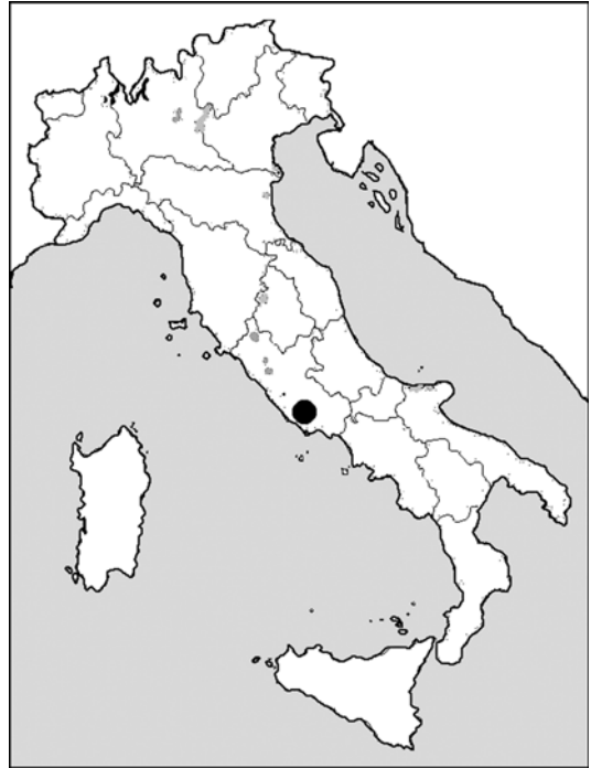
Figure 1 - Map of Italy and sampling site in which 180 salamanders ( Salamandrina perspicillata ) were collected for the experiment.

The sampling site was located on the Lepini Mounts (Latium, Central Italy, Figure 1). Here the oviposition period extends from around the end of February to around the end of April, while the highest concentration of salamanders occurs during the second half of March, when hundreds of spawning females can be found (pers. obs.). On the 23 rd of March 2006, we collected 180 females of S. perspicillata in a breeding site located in the Lepini Mounts. We chose females with unswollen belly which probably were close to the end of their spawning activity and therefore, ready to come