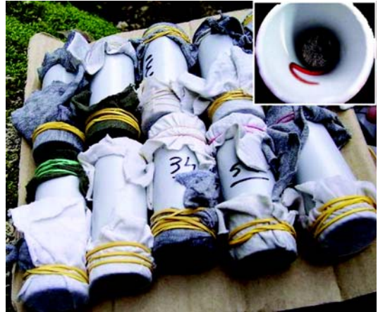
Figure 2 - The plastic artificial shelters where we housed each salamander for 16 hours to mark the tube with their own scent. The square shows a salamander in its own tube.

At the beginning of each test, we placed the focal animal in the middle of an opaque plastic box (26x36x10cm, Figure 3), which was immediately closed with an opaque plastic lid, and we randomly located the two shelters at the opposite-ends of the box. We used 150 different plastic boxes, i.e. one box for each focal salamander. In each test we recorded the position of the salamander in four occasions (trials), one every 60 minutes. Whenever we