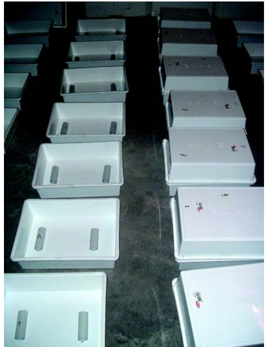
Figure 3 - Opaque plastic boxes used in the experiments. On the left: open boxes in which plastic tube at the opposite ends of the boxes are visible. On the right: boxes with their opaque plastic lids.