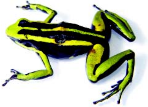
Figure 1 - Epipedobates trivittatus parasitized by larvae of Sarcodexia lambens (Sarcophagidae). This specimen (SVL > 45mm) was found in a small water pool near San Jose village, Peru, in June 2005.

collected, was placed in a ventilated container. Within a week thirty larvae had emerged from the dead frog, and about three weeks later three adults (two males, one female, all = Sarcodexia lambens (Wiedemann, 1830) and deposited in the Zoological Museum, Copenhagen) hatched from their puparia. Unfortunately, wasps of an unknown species had parasitized the remaining larvae.