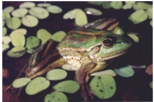
Figure 1 - Adult male of Pseudis tocantins (CHUNB 30355) from Britânia, state of Goiás.

Herein, we present two new records of P. tocantins from states of Mato Grosso and Goiás. The species identifications were confirmed comparing the animals with topotypes and with the original description. All collected animals were deposited at Coleção Herpetológica da Universidade de Brasília (CHUNB).