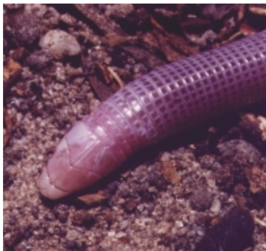
Figure 2 - Amphisbaena ibijara : color in life of the paratype (MZUSP 91986) from Fazenda Santo Amaro, Urbano Santos, state of Maranhão, Brazil.

contact with the latter. Ocular quadrangular, contacting second and third supralabials, frontal, and first temporal; eye indistinct. First temporal as wide as frontal and much larger than ocular, contacting ventrally a smaller temporal scale. Posterior margin of head formed by parietals and temporals, almost straight, in contact with first annulus.