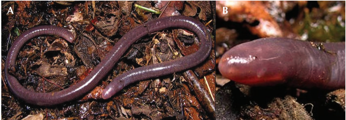
Figure 4. (A) General aspect of Luetkenotyphlus brasiliensis (MZUFV 10214) in life. (B) Detail of the head.

vouchered records of L. brasiliensis in Minas Gerais. Serra do Brigadeiro mountain, where Serra do Brigadeiro State Park is located, corresponds to northwest region of the Serra da Mantiqueira mountain range, also corresponding to the highest elevation from which the genus is known (i.e., 1350 m). Most records of Luetkenotyphlus are from lower-elevation regions, usually less than 500 m (IUCN 2011).