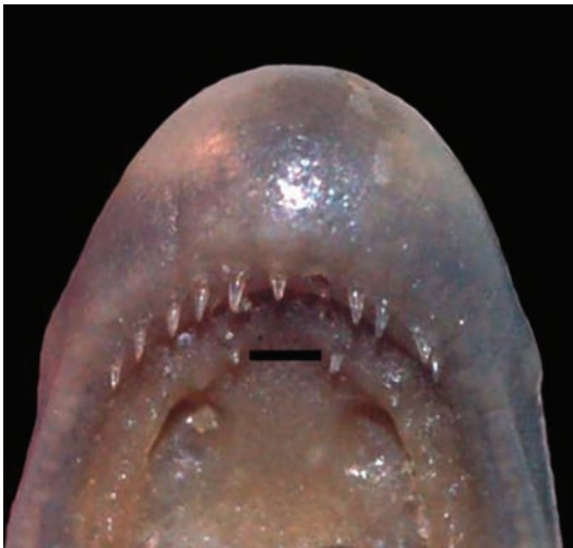
Figure 3. Palatal region of a juvenile specimen of Luetkenotyphlus brasiliensis with 117 mm of total length (MZUFV 3941). Vomerine diastema represented above by the black bar.