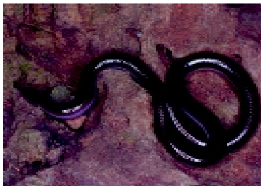
Figure 2 - Leptotyphlops brasiliensis from Estação Ecológica Uruçuí-Una, Piauí, Northeastern Brazil.

The reserve consists of high and lowland areas resulting from the dissection of relictual arenitic plateaus. The lowland part of the reserve is covered by typical Cerrado vegetation, either on rocky or sandy soils, interrupted along drainages by gallery forests. Gallery forests are absent from the plateau (Chapada), where the Cerrado is continuous and better preserved than on low altitudinal areas, growing only on sandy soils. Our total survey effort in the area along three field campaigns (February-March 2000 / July 2000 / January-February 2001) was equivalent to 2,080 pit-fall.day. Collecting effort was significantly more intensive in the lowland areas than in the plateau (respectively, 180 and 1,900 pit-fall.day), but L. brasiliensis was only found in the highlands. However, the lowlands of the Reserve are highly degraded by local population, who set fire to extensive areas of